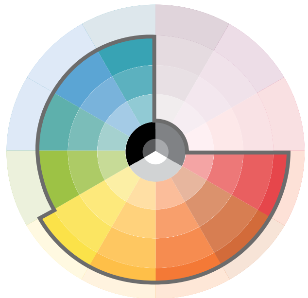
Screen Printing: ideal color range

Highlighted colors (within dark gray border) represent the approximate ideal color range available for digital printing. Not all colors within the complete color wheel are possible.